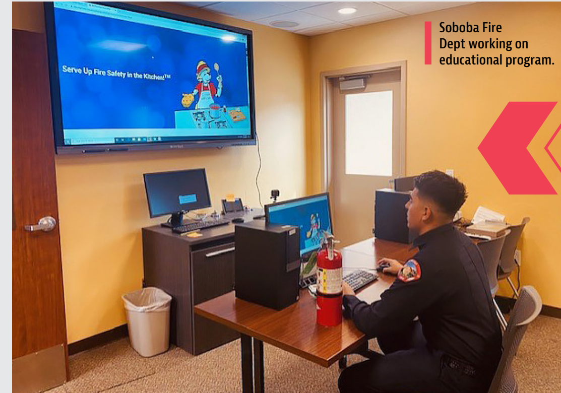
Soboba Fire Dept working on educational program.

Kern County Fire Safe Council volunteers distributing free Go-Bags for their community.